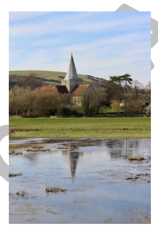
April 2025 / v0.75 DRAFT for comment